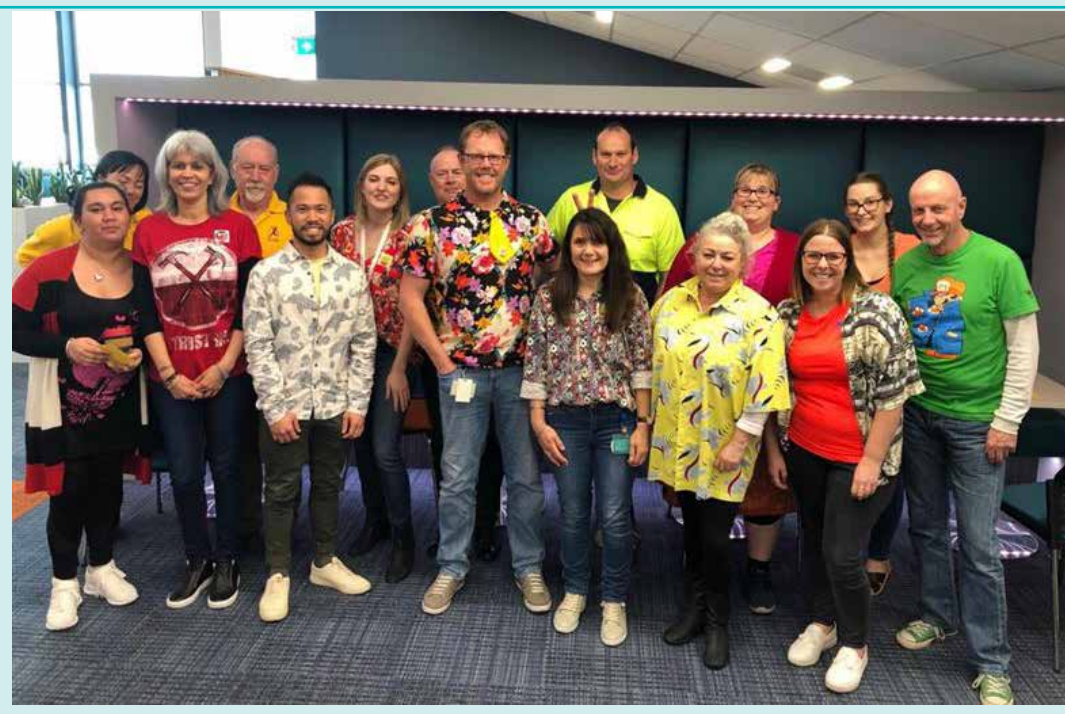
Loud Shirt Day 2019 - raising funds for people with hearng loss

Our teams love to give back—whether it's donating blood together, baking to raise money for charity, or getting LOUD to spread awareness of a good cause.